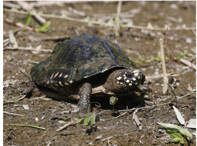
Spotted pond turtle Geoclemys hamiltonii from the Bahuni river, Shuklaphanta National Park, Nepal.

The spotted pond turtle is easily recognized by the white spots on its black neck, its black carapace with three prominent keels, and yellow spots on the iris. It inhabits both rivers and lakes. On 30 October 2023, a single spotted pond turtle was observed by author KRB during an anti-poaching patrol in the National Park, near the Bahuni river. It was not captured or otherwise disturbed, and photographs were taken from a distance. This observation highlights the importance of regular monitoring and improved reporting among stakeholders, given the illegal trade of the species. We also recommend public outreach for its conservation and targeted species conservation actions, to inform